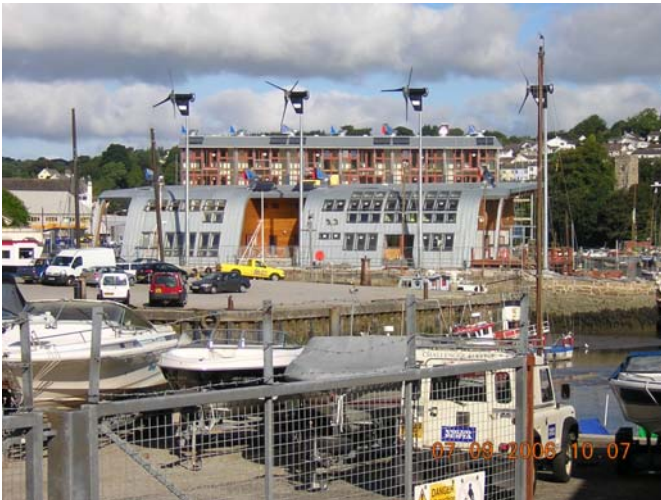
Left: The Jubilee Wharf development with 4 Proven wind turbines in the foreground.

Contact: Bill Dunster at mail@zedfactory.com