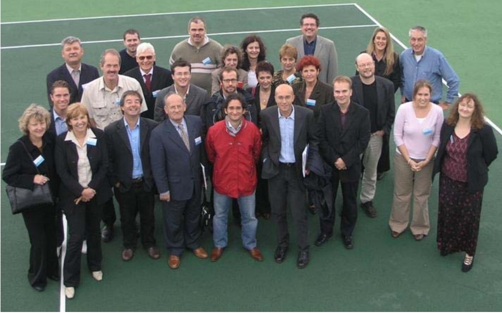
Above: The ASPIRE project partners. 20 Oct 2006

heritage, issues and aspirations for the area. The partners ended 2 days of workshops and discussions with a visit to the Eden Project.